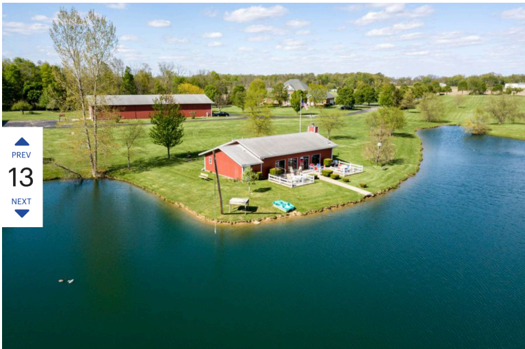
This ranch style home has three bedrooms.