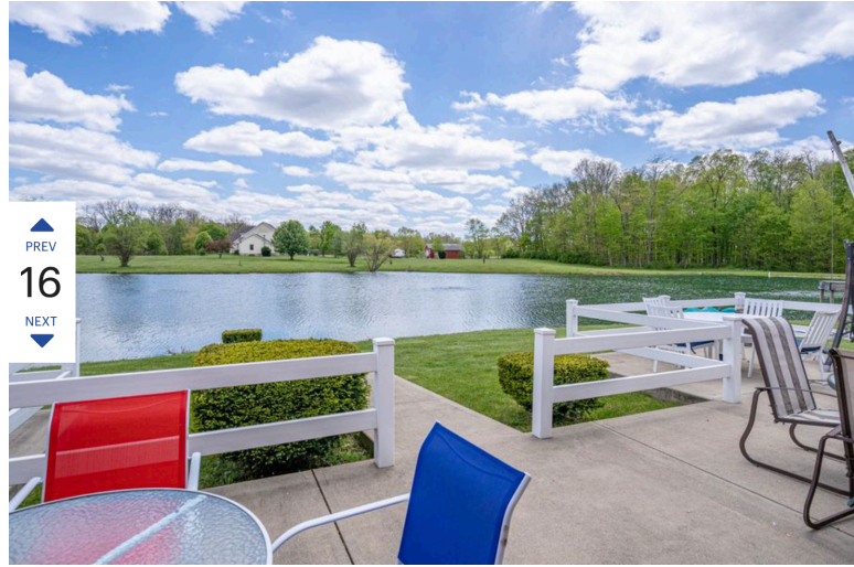
Party barn with walkway to pond.