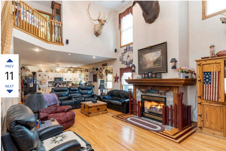
Four bedroom home with first floor master.